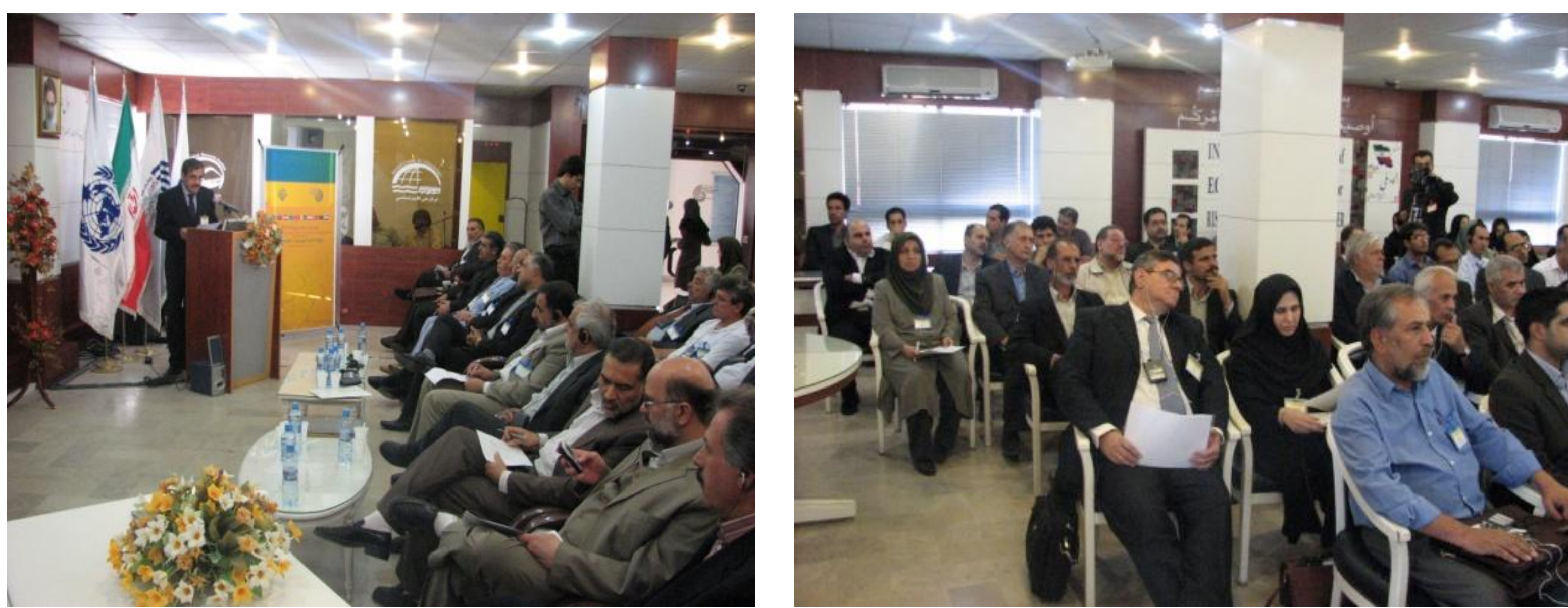
Figure 1. Opening Ceremony of ECO-Regional Centre for Risk Management of Natural Disasters (ECO-RCRM) in September 2007, Mashhad-Iran, National Center for Climatology.

In line with the agreement reached in the 17th Regional planning council (RPC), February 2007, and the 3rd ECO Ministerial Meeting on Agriculture, March 2007, the Islamic Republic of Iran Meteorological organization of the has suggested to host the 1st ECO Meeting of the Heads of Meteorological organizations in September 3-4, 2007, in Tehran. Following the above meeting, the inauguration ceremony of the Regional Center for Risk Management of Natural Disasters will be held in September 5, 2007, Mashad, Iran.