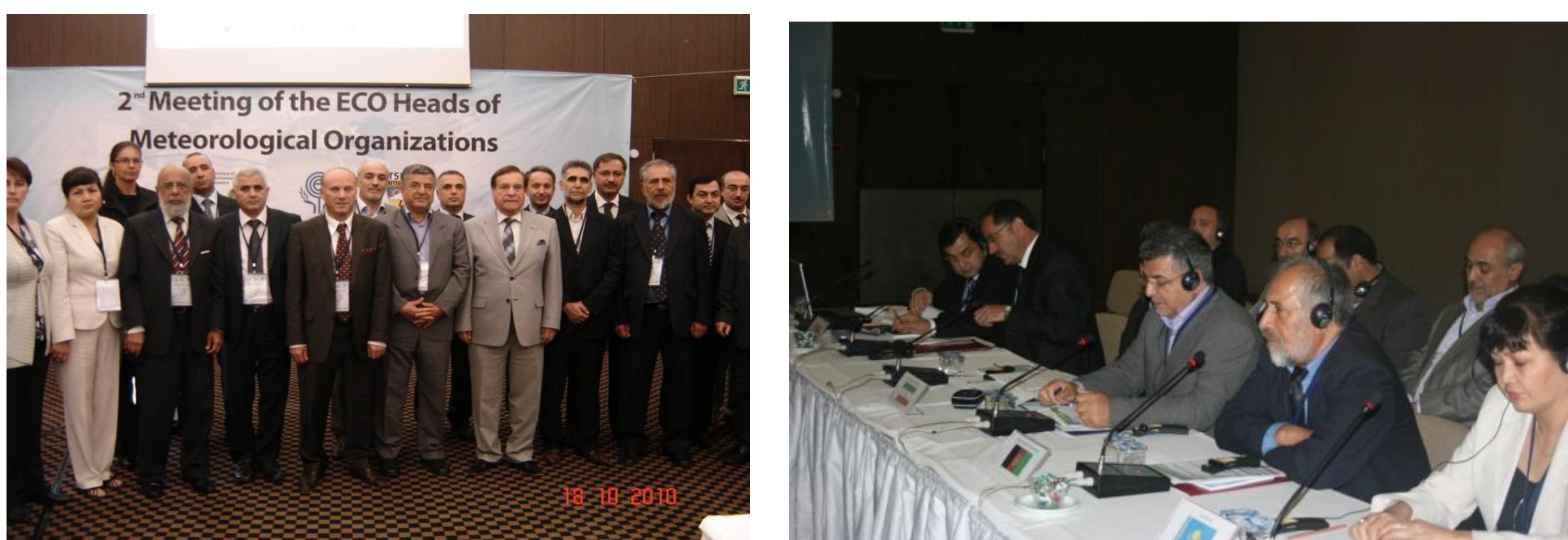
Figure 2. Second meeting of the ECO heads of Hydro-meteorological services, Turkey, Antalya, October 18-19, 2010.

The second meeting of ECO Heads of Hydro-meteorological Organizations was held in Turkey on 18-19 October, 2010 with the participation of Iran, Turkey, Pakistan, Afghanistan, Kazakhstan, Azerbaijan, Kyrgyzstan Republic, representative of UNDP(as an observer) and the ECO Secretariat.